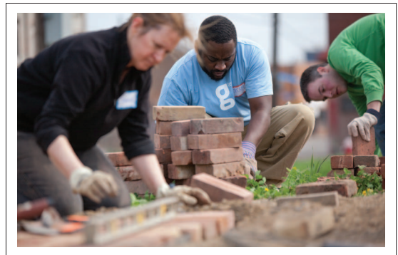
Special events at the conference included Pitch In for Pittsburgh, a volunteer activity sprucing up reclaimed land with GTECH Strategies.

Close to 550 participants deliberated on philanthropy's role as a leader and innovator during changing times at the 2010 GEO National Conference in Pittsburgh, held in partnership with Grantmakers of Western Pennsylvania. The conference provided cutting-edge content that deepened participants' understanding of the relationship between grantmakers and grantees, the innovative ways that grantmakers can enhance nonprofit results and the importance of networking in grantmaking and nonprofit communities.