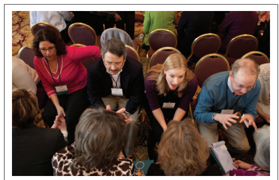
GEO launched an Ambassador Program designed to facilitate and deepen both first-time and seasoned participants' networking experience by creating lasting connections that strengthen grantmakers' work and build community. More than 130 attendees participated in GEO's inaugural Ambassador Program.